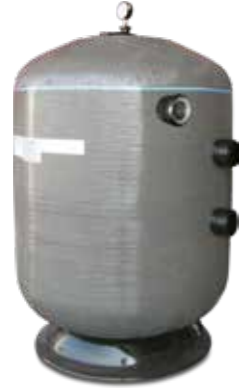
WATERCO COMMERCIAL SAND FILTER, SMD