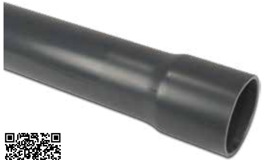
PRESSURE PIPE PVC-U, 10BAR