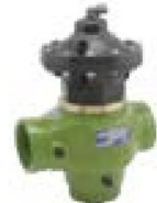
Victaulic 3" x 2"