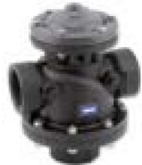
2" x 2"